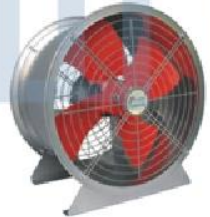
SF-I型一字脚岗位机 Fixed type with stamping base plate fan