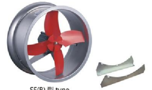
SF(B) 型 type

SF(B) series adopt special twisted blade design and flange flanging casing, which makes the noise lower and the air volume larger. The advanced painting process maintains surface smooth and beautiful. The series are featured by good performance, asy maintenance and used to transport air in workshop storage and places of recreation and other places. But these places shouldn't contain flammable, explosive and corrosive gases, with a temperature no higher than 50℃.