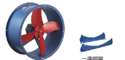
EB 型 type

EB series adopt special twisted blade design and flange flanging casing, which makes the noise lower and the air volume larger. The series are featured by good performance, easy maintenance and used to transport air in workshop storage and places of recreation and other places. But these places shouldn't contain flammable, explosive and corrosive gases, with a temperature no higher than 50℃.