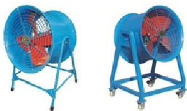
SF-II 型type SF-III 型 type