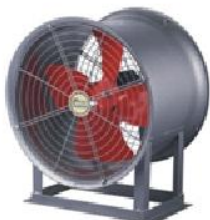
SF-I型固定岗位机 SF-I type for fixed status